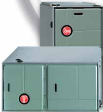
Model RGRM Upflow - 95% Efficiency